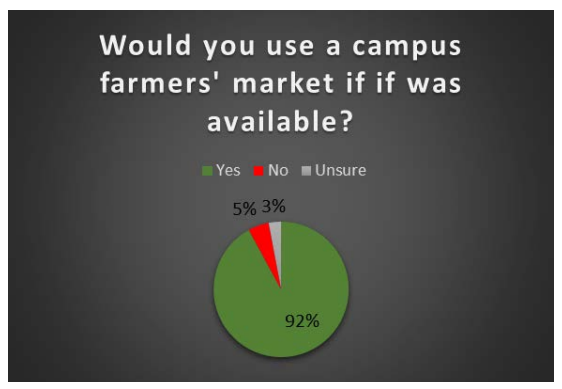
Figure 3 - Survey Results - Use of Farmers' Market

This positive feedback from our survey confirmed the results of an additional survey that had taken place last year. This survey was affiliated with the Office of Sustainability and College of Pharmacy and Nutrition. The results indicated that there is substantial demand for local foods on campus and that the success of a farmers' market on campus would depend on accessibility and affordability. The survey recommended that further research regarding a campus farmers' market should be focused on looking at the current food systems on our campus, looking at examples of food initiatives on other campuses, and educating the campus community about local food. The span of our project covers the first two recommendations, and the third would be implemented with the implementation of the campus farmers' market.