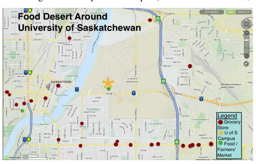
Figure 1- Food Desert present around U of S campus

An article was published earlier this year in the University of Saskatchewan news, addressing food security on our campus (See references – Foster, 2015). The article